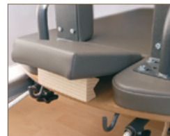
three headrest positions for proper neck alignment