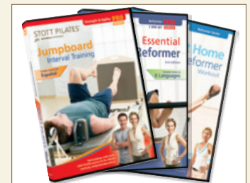
Three DVD workouts with demonstrated exercises