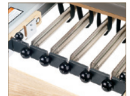
one half- and four full-tension springs secure quickly & safely