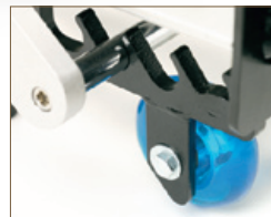
four footbar positions drop easily into cradles