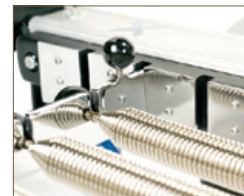
six carriage stopping positions for different body sizes