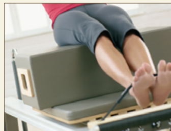
Reformer Box with Footstrap adds challenge and variety