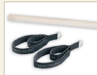
Maple Roll-Up Pole and Double Loop Straps for hands & feet